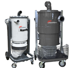
PRE-SEPARATORS WITH CYCLONE